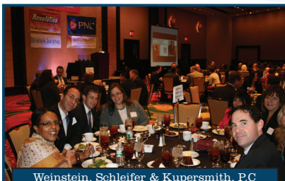
Weinstein, Schleifer & Kupersmith, P.C enjoying the Friends of the Fund Luncheon

On November 19, 2010, Community First held its annual Friends of the Fund event. One of the more than 350 attendees said, "This was a top rate-event, very well run. The variety of attendees and organizations represented was very impressive."